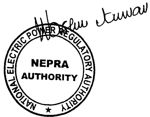
Waseem Mukhtar Chairman